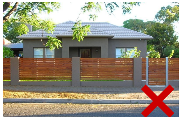
(The fence is located within the front setback area and is over 3 feet in height)